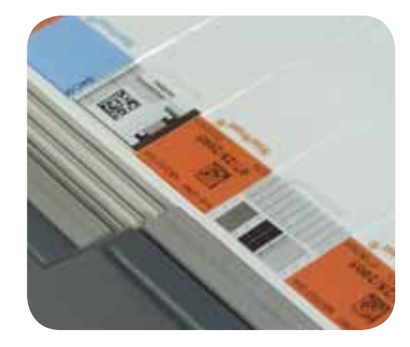
Easy and reliable identification with 1-D and 2-D bar coding