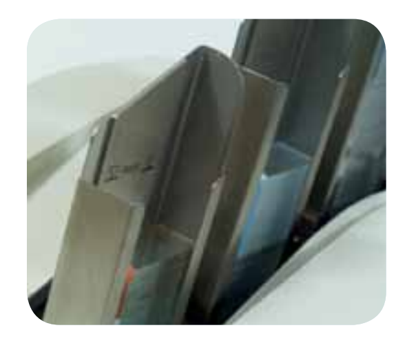
Load up to 480 cassettes or 450 glass slides at once